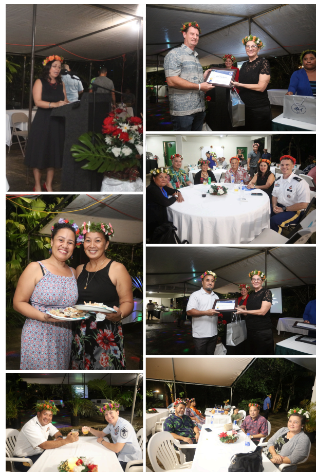
Appreciation Dinner for 25th Anniversary major donors to the college endowment fund held on December 10, 2021