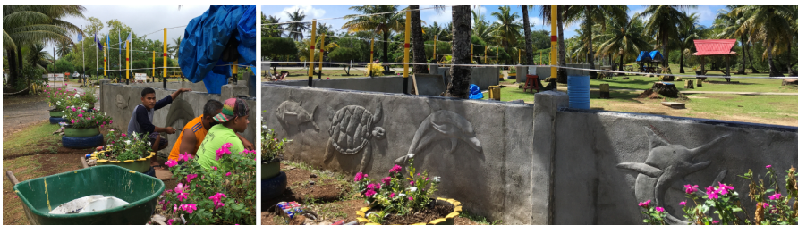
FSM-FMI cadets learning the skills of wall cement carving.